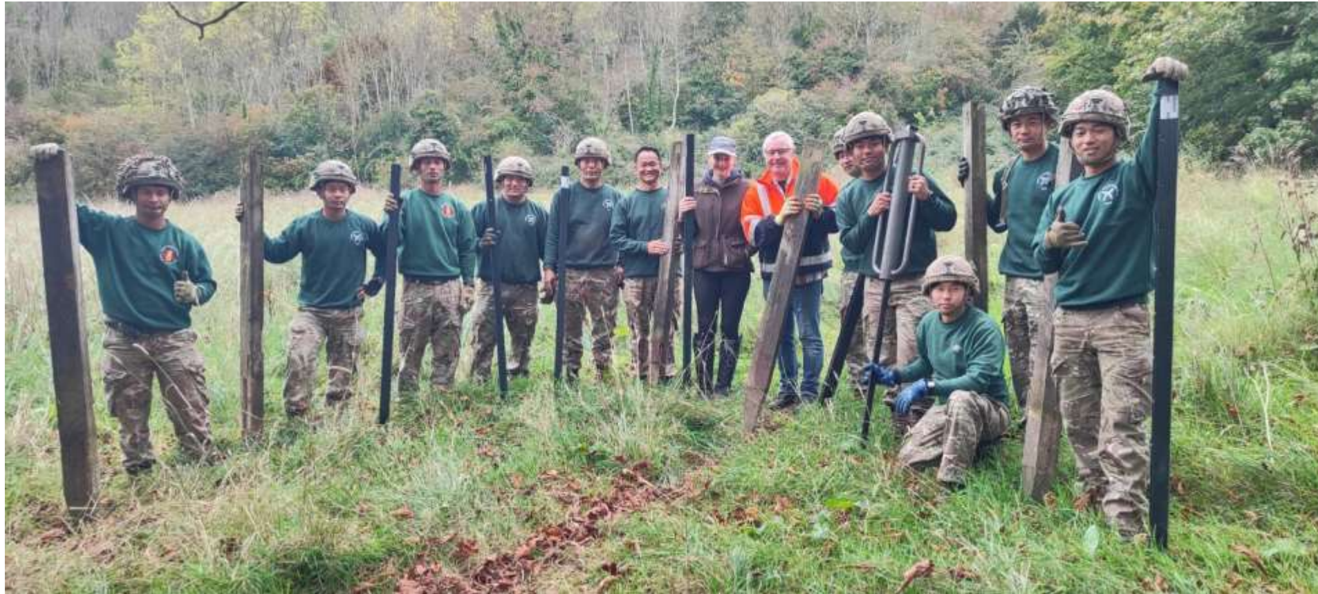
LWC Gurkha Coy repaired the fence