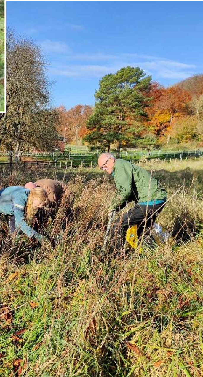
LWC conservation volunteers pulling up ragwort