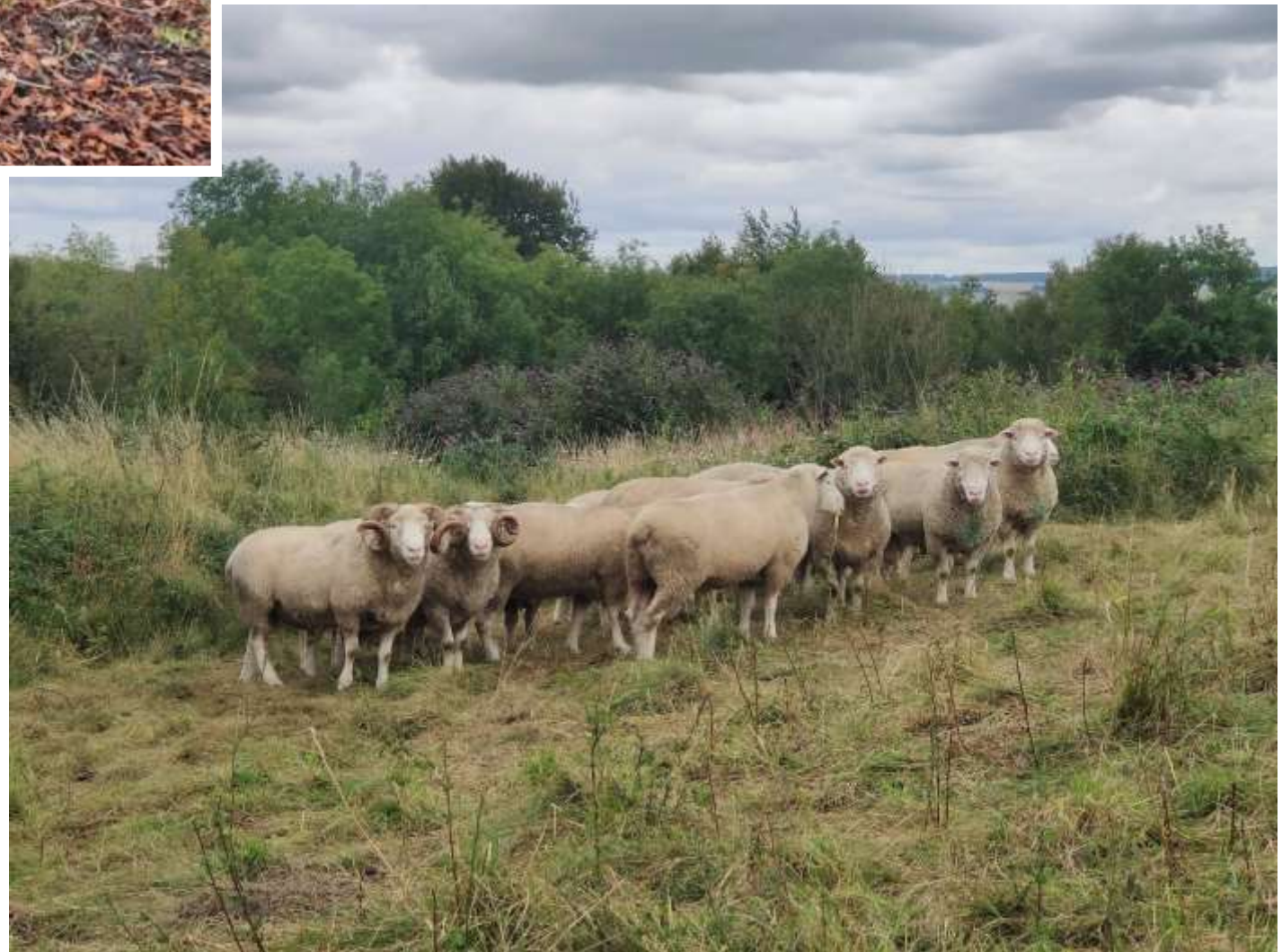
Sheep grazing Copheap County Wildlife site