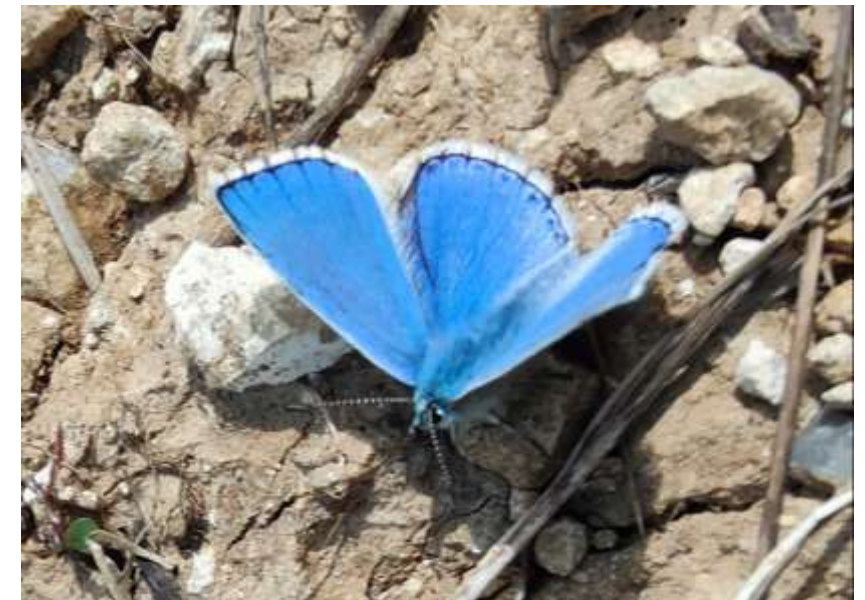
Adonis Blue butterfly