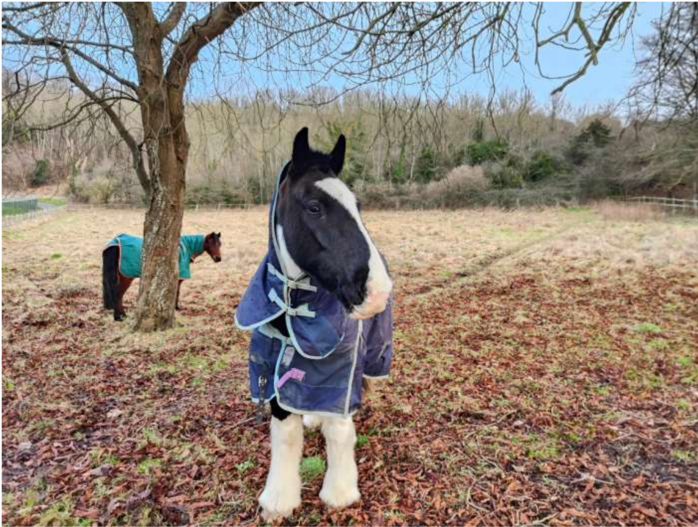
Horses, from Warminster Saddle Club, grazing the paddock at Oxendene