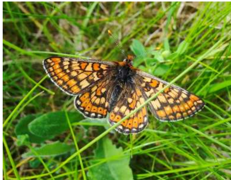
Marsh Fritillary butterfly