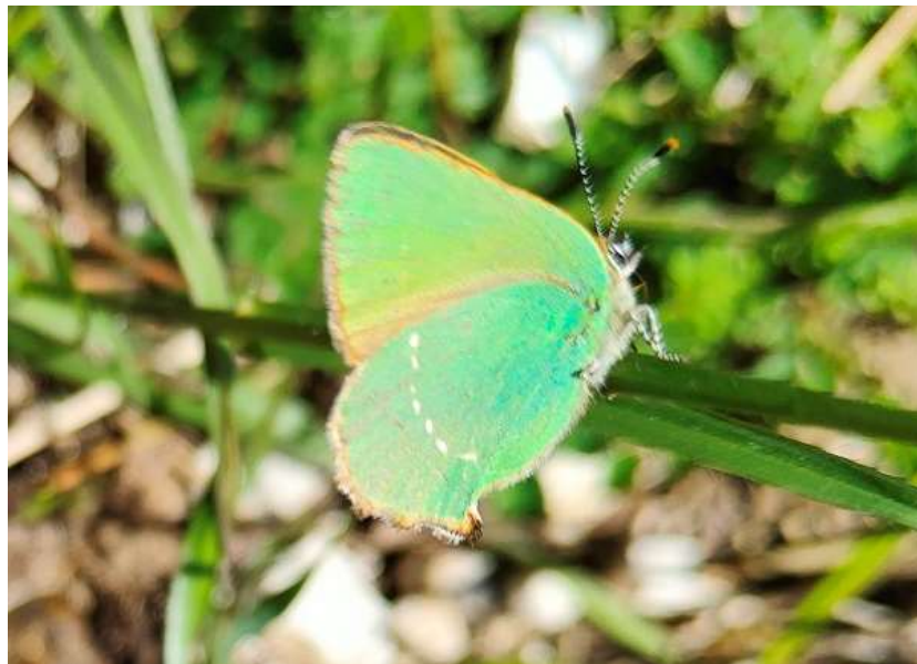
Green Hairstreak butterfly