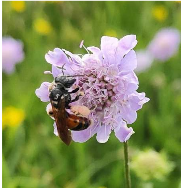
Large Scabious Mining bee